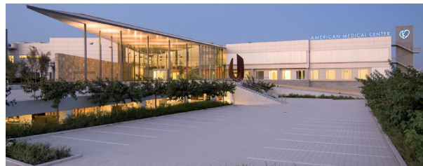
Advanced Medical Facilities