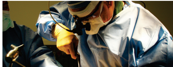
World leading US Surgeons