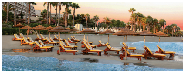
Top Holiday Destination